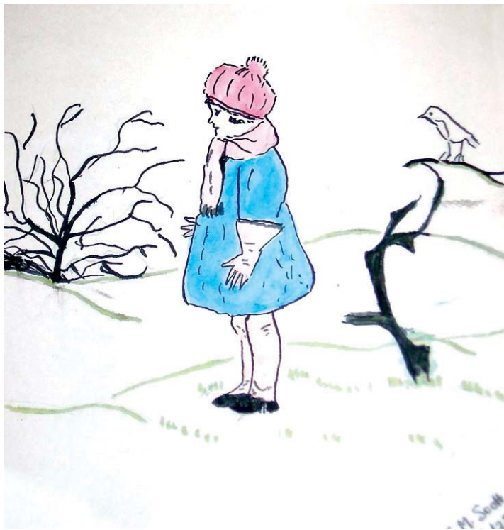
A little drawing from J M Scott 30/1/ 1928