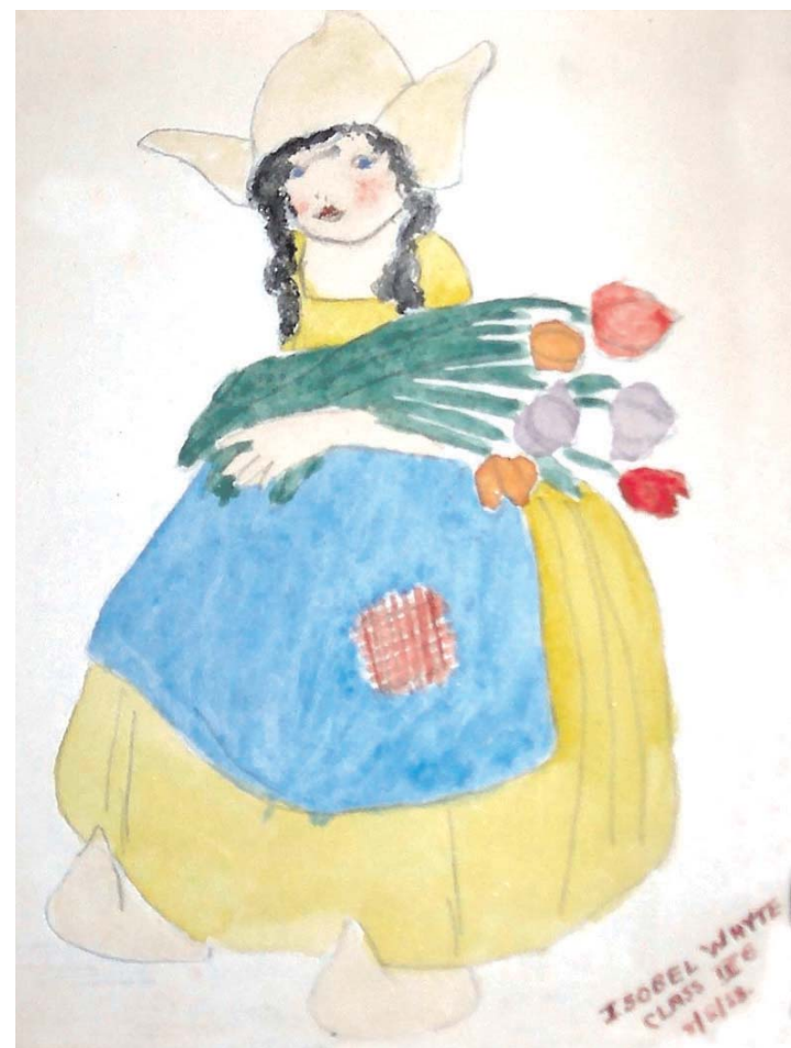
An entry by Isobel Whyte 8/2/1928