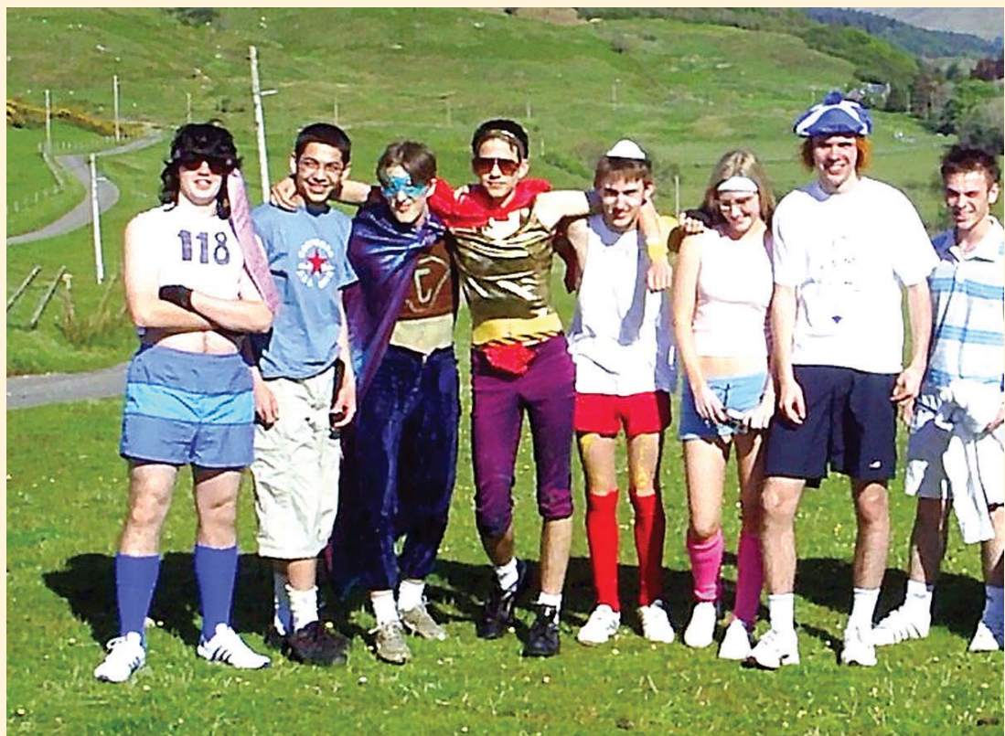
The Oban high pupils who organised the fun run to raise money for the Laurinburg

It was an action packed two weeks for the young Scots. Before arriving in North Carolina the pupils stopped off in New York where they saw the 'Big Apple's' most famous sites; the Statue of Liberty, Wall Street, the Ground Zero site, Macy's store,